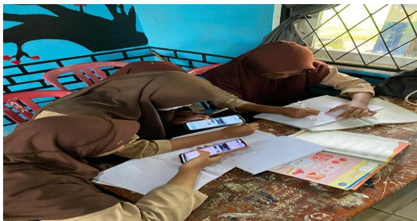
Figure 2. Application of Electronic Student Worksheets among Students in the Experimental Class

The utilization of electronic student worksheets with a contextual approach was implemented in 5 sessions for the experimental class and deployed via the Liveworksheet platform. These student worksheets are designed to be completed online by students, and their results can be viewed in real-time. These are no longer in print form, eliminating the need for educators to print them on paper, instead they can be distributed through links or barcodes. The usage of electronic student worksheets through Liveworksheet by students is depicted in the following figure.